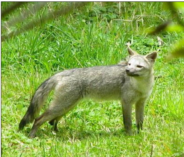
Figure 1. Individual crab-eating fox recorded at 3,690m asl, at sub-páramo ecosystem near Los Nevados National Natural Park, Caldas department, Central Andes of Colombia. This is the highest elevation record for the species.

The specimen with the highest elevation record was an adult male (Figure 1) observed opportunistically on 15 May 2014 (12:45h) at the sub-páramo ecosystem at Playa Larga locality, Caldas department, Colombia (4°51'30.6" N, 75°23'09.7" W) (Figure 2). It was moving between forest patches, in a highly fragmented area of livestock farming (near Los Nevados National Natural Park). The altitude of this record was 3,690m asl, therefore, this record extends the altitudinal range of C. thous by 290m. The second highest elevation record for the species comes from the Antioquia department in the central mountain chain of Colombia at 3,400m asl (Cuartas-Calle and Muñoz-Arango 2003, Solari et al. 2013).