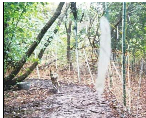
Figure 2. A solitary, male red wolf (M1166) in the portable, electrified acclimation corral.

An additional electrified 16-gauge wire at ground level prevented animals from digging out of the corral. A solar-charged, battery-operated 12-volt fence charger (Model Parmak Solar Magnum Charger, Country Supply, Louisiana, MO 63353) provided electricity to the interwoven and digging wires. The upper portion of fencing was approximately 10cm by 15.25cm non-electrified, plastic mesh (Model Barrier Fencing, Forestry Supplies Inc., Jackson, MS 39284). The plastic and nylon fencing were fastened together and to polyvinylchloride (PVC) posts using cable ties, then secured to the ground with nylon ropes and stakes.