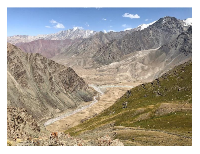
Figure 1. Ters-Agar Pass in southern Kyrgyzstan.

amplified a region of the mitochondrial cytochrome b using carnivore specific primers (Farrell et al. 2000). We obtained 147bp of sequence data which was compared to GenBank to confirm the species to which the scat belonged. Our sequence data matched 100% with Cuon alpinus cytochrome b (cytb) gene (Accession number MW911472.1). We believe this is a new record of the purportedly extirpated dhole in the Chon-Alai district and marks a northward extension of its previously published distribution by approximately 1,000 km (Figure 2). Our data has been deposited in Genbank, Accession number MZ813093.