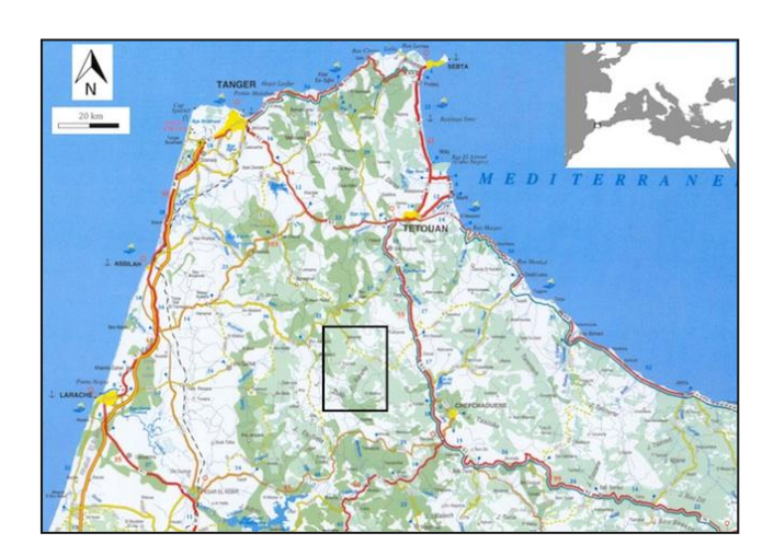
Figure 1. Location of Bouhachem in Morocco