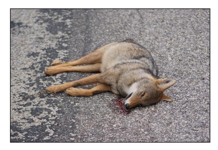
Figure 2. Dib killed by a vehicle in Bouhachem – October 2012

A single haplotype for the two individuals was obtained at cytochrome B but both had different control-region haplotypes, differing by a 1bp mutation. The sequences for each animal were concatenated and aligned against publically available data for Canis species obtained from Genbank (from Aggarwal et al. 2007; Bjornefeldt et al. 2006, Rueness et al. 2011, Gaubert et al. 2012). The resulting alignment was 579bp long. The alignment file is at http://www.rzss.org.uk/staff/dr-helen-senn and the sequences have been deposited in Genbank under the accession numbers KM670012-KM670014.