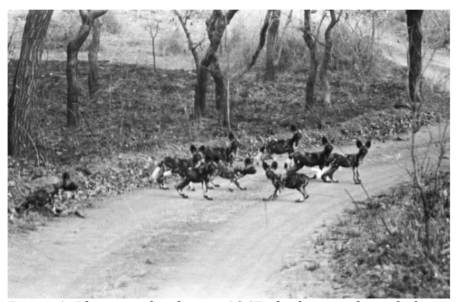
Figure 1: Photograph taken in 1967, the last confirmed observation of African wild dogs in the Bénoué Complex