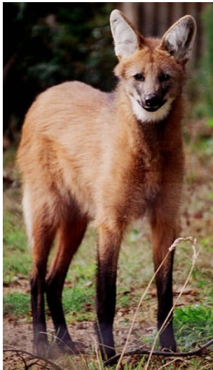
Figure 1. The maned wolf, photo from Questionnaire 1 (The Ark Gallery, Durrell Wildlife Conservation Trust).

The maned wolf (Figure 1) is an endemic South American canid, large in size (up to 90cm tall at the shoulder, averaging 23.3kg), and atypical in habits (Dietz 1984; Rodden et al. 2004). Maned wolves are solitary and monogamous, and have small litter sizes (two to three on average). They are easily identifiable by their long dark legs, orangey brown coat and dark mane (Consorte-McCrea 1994). Their original distribution is open areas of Paraguay, north Argentina, also Bolivia, Peru and possibly Uruguay, central and southern Brazil, inhabiting grasslands and bush (Cerrado), wetlands and swamps (Pantanal) (Rodden et al. 2004; Paula et al. 2008).