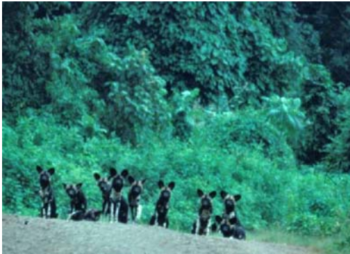
Figure 1. Group of wild dogs along the Rira-Delo Mena road in the Hareenna Forest.

While Ethiopia harbours several relict dog populations (Malcolm and Sillero-Zubiri 2001), most data is anecdotal and surveys are needed to assess status and conservation outlook. Malcolm and Sillero-Zubiri (2001) reported wild dog presence in eight areas, with dogs possibly resident only in four protected areas (Bale Mountains, Mago, Omo and Gambella National Parks), and the south eastern lowlands. Wild dogs are fully protected in Ethiopia, but the only dog population with minimal protection is that in the Bale Mountains National Park (BMNP), where it inhabits montane wet forest in the Hareenna forest (Figure 1). Wild dogs are known in Ethiopia as Takula (Amharic) and Yeyii (Orominia).