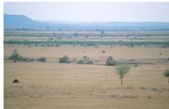
Figure 3. Semi-arid short grasslands of Rollapadu Wildlife Sanctuary, among the most endangered eco-systems in India.

Rollapadu Wildlife Sanctuary (Kurnool District, Andhra Pradesh) – In the plains between Yerramalai and Nallamalai hills of Andhra Pradesh (Figure 3), 6.1km 2 of undulating semi-arid short grassland established in 1988 for the protection of Great Indian bustard.